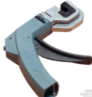
TE Part # 58372-1 HEAD (IDC) 2MM C.T. W/O TL