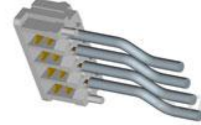
TE Part # 3-173977-0 CT MT REC ASSY 10P BLUE