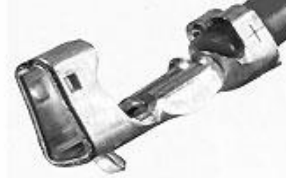
TE Part # 353918-1 CT 1.5MM REC CONT CRIMP TYPE